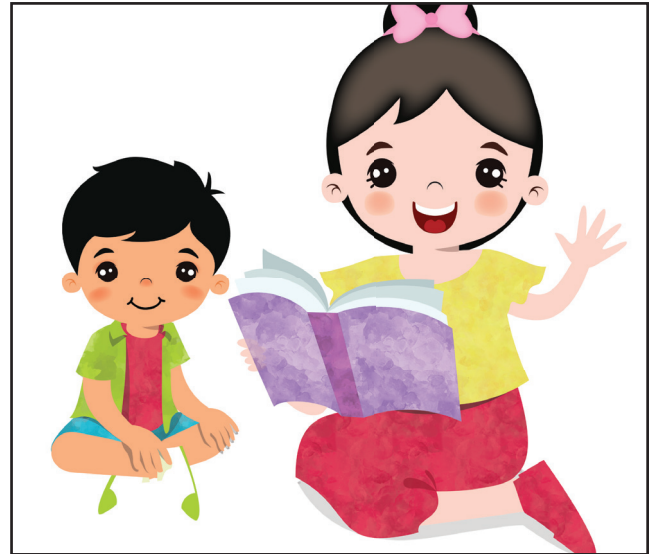
Reading my Bible