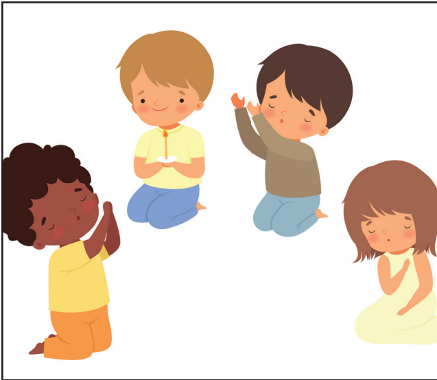
Praying and talking to God

What is one command from God's Word that you can obey today? Check one of the pictures.