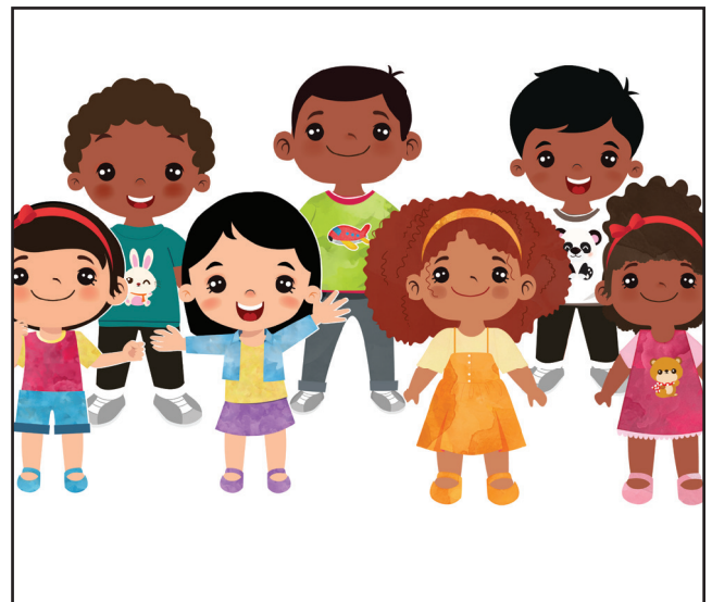
Being kind to everyone I meet