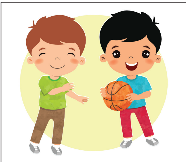
Sharing with my friends