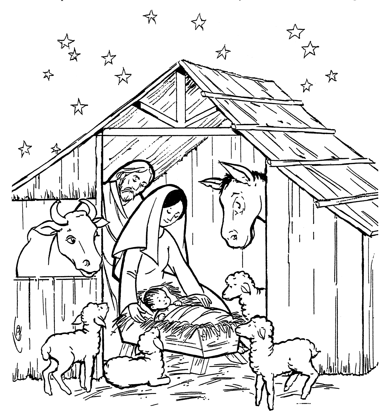
"I beseech you therefore, brethren, by the mercies of God, that ye present your bodies a living sacrifice . . . ." Romans 12:1

Color the pictures. Then add some colored stars to the sky and some cotton to the sheep.